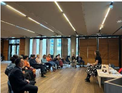
Face to face training in Hungary