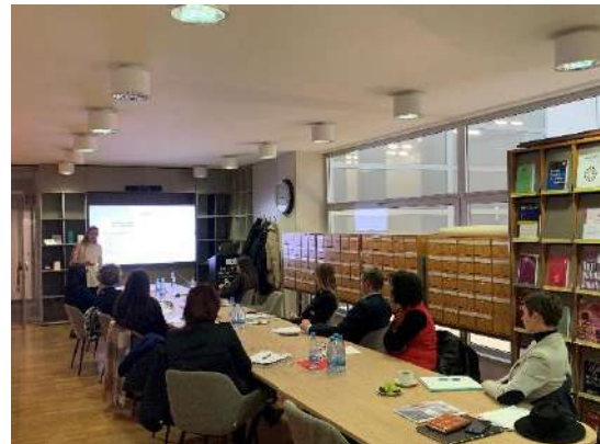
Face to face training in Slovenia