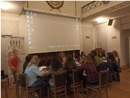
Face to face training in Greece

Two-day interactive workshops were conducted in Greece, Bulgaria, Hungary, and Slovenia between October 2025 and February 2026 aiming to enhance lawyers' understanding and application of EU and national law regarding child victims, with a strong focus on psychological and communication approaches tailored to children. The trainings were delivered both in-person and online format. In Bulgaria, 81 lawyers attended the trainings in-person; in Slovenia, 41 lawyers attended the trainings in-person; in Greece, 128 lawyers attended the trainings conducted both in-person and online, and in Hungary, 101 lawyers attended the trainings conducted both in-person and online. A total of 351 lawyers attended the training workshops.