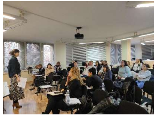
Face to face training in Bulgaria